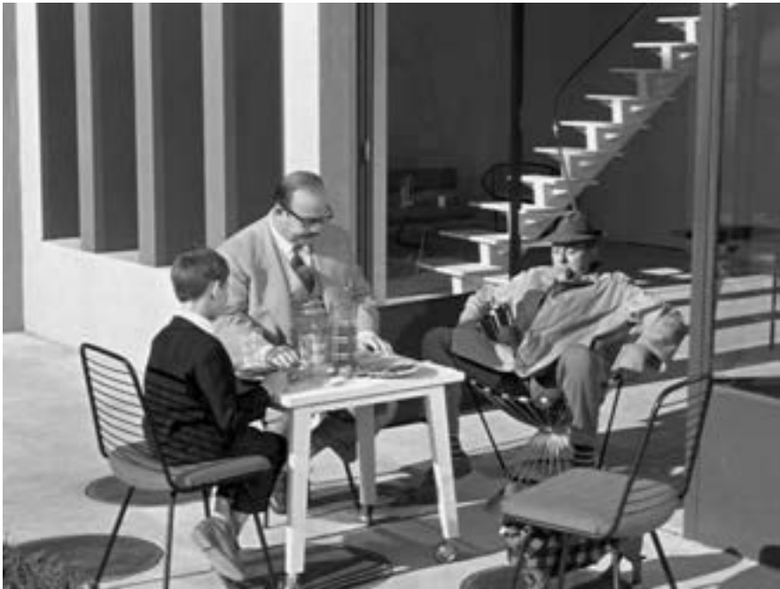
Film still from Jacques Tati's MON ONCLE (1958).

This hypothesis can be linked to Sartre's theory of the positional or unreflexive consciousness, which he defines as the immediate awareness of objects. In which case we could speak of a positional camera. Indeed, in the finished movie, after many transformations with regards to editing and other technical devices that have been applied to picture and sound, this neutrality is removed by a cascade of imprinted representations and meanings. This is why the positional camera characterizes less the film in general than the borderline cases, special film forms, starting with comedy, that originate in the real: "[...] before becoming comedy by unsuccessful representations," Clement Rosset says, "everything is first comical [...] merely by the fact that it exists." 39 Let us return to subjectivity as an ontological category. Jacques Tati's character M. Hulot, "l'Ange Hurluberlu" as André Bazin calls him, 40 perfectly exemplifies the idea of the immediate awareness of things caught in their ontological purity when, in MON ONCLE (1958), he exchanges his familiar world – the small-town world represented by the street sweeper, the postman, the caretaker, the vegetable merchant and the bicycle – for the modern world represented by the cubic house of the Arpel family (modeled on Le Corbusier's Villa Savoye). At ease in the first world, Hulot, in the second, looks like an angel, that is, in the words of Jean Cocteau, like an angelic poet walking with a