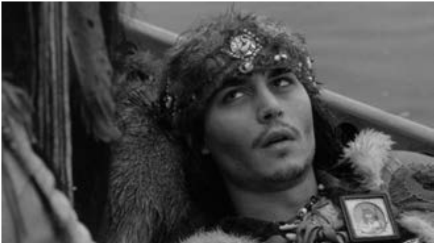
Film still from Jim Jarmusch's DEAD MAN (1995).