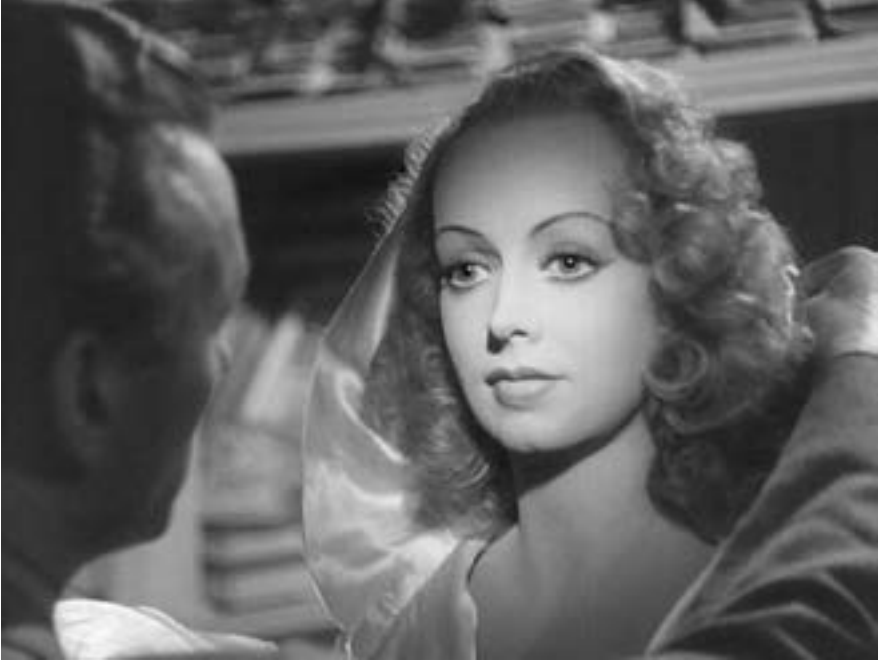
Film still from Jacques Becker's FALBALAS (1945).

used to seeing such a device in a John Cassavetes film: his films tend to have a more physical style. Such a judgment can be considered as a second kind of aesthetical judgment, insofar as it does not evaluate the film from a standard (related or not to the medium definition) but as it is. Apart from these two kinds of judgments, Becker's attempt (as much as Cassavetes') calls our attention to the fact that a represented hallucination makes visible something that only the hallucinating character is supposed to see because his mind produces the percept of something that does not exist. However, the requirement, at the same time, that this fantasy objectification needs to cling to something real like FALBALAS' mannequin, that is to a percept that the mind receives instead of creates, refers significantly to the definition of film itself. Following Freud, Christian Metz defines the relation between a hallucination and a film as a "paradoxical hallucination." He sees it as a hallucination because we take fiction for a kind of reality and as "paradoxical because unlike a true hallucination it is not a wholly endogenous psychological production: the subject, in this case, has hallucinated what was really there, what at the same moment he in fact perceived: the images and sounds of the film." 79