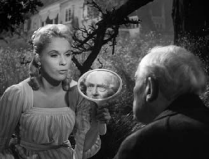
Film still from Ingmar Bergman's WILD STRAWBERRIES (1957).

This is how things are in some scenes from Ingmar Bergman's WILD STRAWBERRIES (1957).