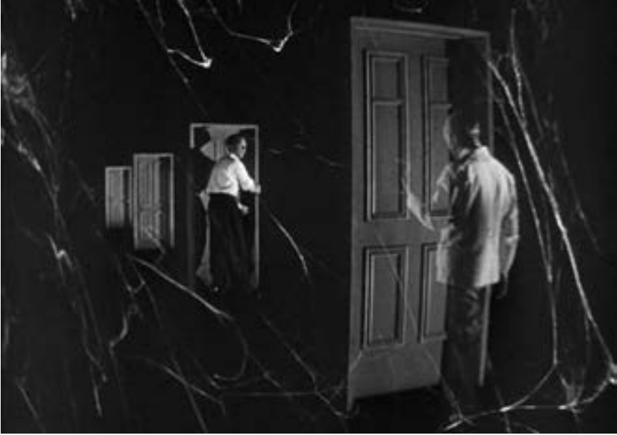
Film still from Edward Dmytryk's FAREWELL MY LOVELY (1944).

affected visual experience. 13 But the shots that make up this scene are not PoV shots; we see Marlow himself in these shots, and see things from points of view other than his. 14 We may think that his experience is similar, in respect of the appearance of cobweb-like inflections, to our own current experience of seeing the shot, without thinking it similar in respect of point of view. 15