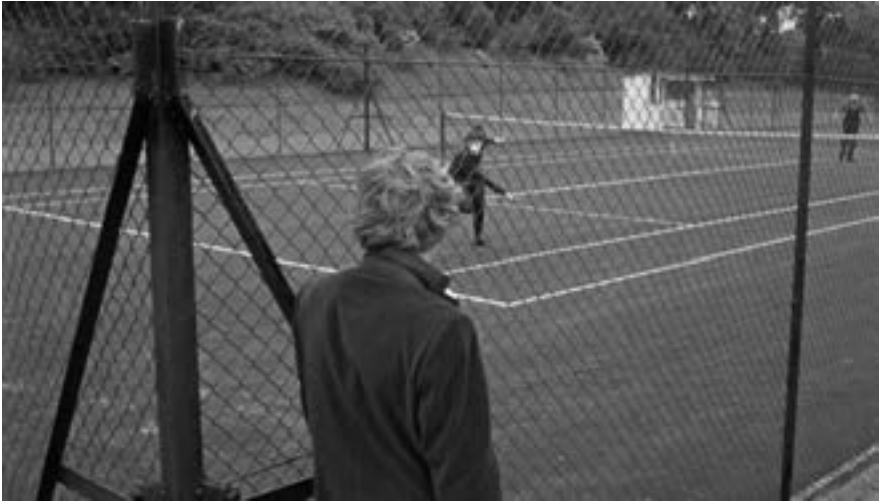
Film still from Michelangelo Antonioni's BLOW UP (1966).

stillness that responds to it is in no way a sign of a lasting harmony, though. It represents and entails the chaos of things, but it also opens to the possibility of a more meaningful relationship between man and his environment. The park, in this perspective, becomes a metaphor for the lost order of nature, an order which emphasizes the meditative character of the elements (the wind blowing in the trees) and the introspective quality of the gaze.