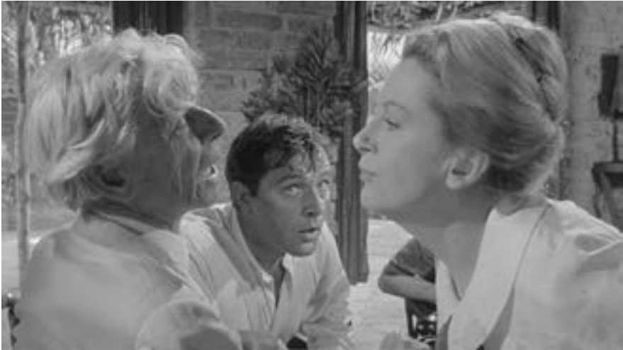
Film still from John Huston's THE NIGHT OF THE IGUANA (1964).