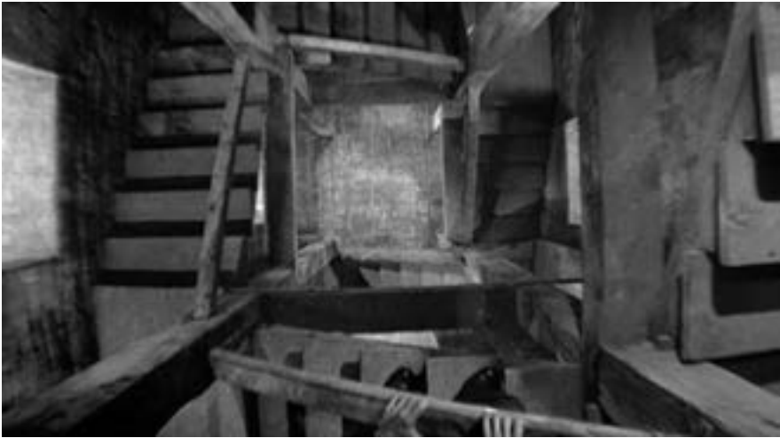
Film still from Alfred Hitchcock's VERTIGO (1958).

landscape invention where land transformation can use artificial means in order to induce a natural effect, this kind of filmic subterfuge rests upon a device in situ that gives a natural sensation in visu .