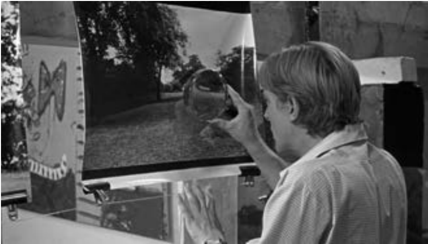
Film still from Michelangelo Antonioni's BLOW UP (1966).

punctum; for punctum is also: sting, cut, little hole – and also a cast of the dice. A photograph's punctum is that accident which pricks me (but also bruises me, is poignant to me). 7