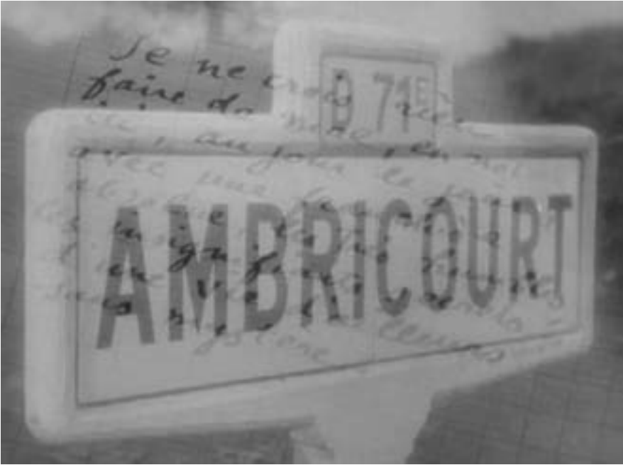
Film still from Robert Bresson's DIARY OF A COUNTRY PRIEST (1951).