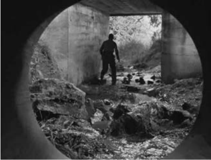
Film still from Delmer Daves' DARK PASSAGE (1947).

taches [to a form of] visual identification [in] which the character whose point of view we share remains estranged from us.” 3 However, what is truly uncanny about this estrangement is that it is not just ours but also Vincent’s. Indeed, staggering out of that circumscribed black hole into the objective light of day and visibility, Vincent seems also to be escaping the circumscription of his own subjective vision.