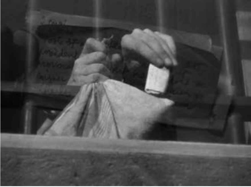
Film still from Robert Bresson's A MAN ESCAPED (1956).

Of course, the journal voice is that of the priest whom we see in the picture [...]. But the subject is constantly split up into an image and a voice, both of which are never presented as synchronous: the priest is writing after the event and, when his voice gets superimposed upon the image, it covers up that of the interlocutor, which is instantly smothered and cancelled. 6